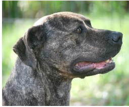
I've been told that one day I may have my own home.

"It is through people who care that a kinder, gentler nation can become a reality."