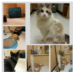
We're waiting for you at Petsmart

"It started with a senior class project."