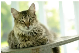
My friends and I need homes. Please spread the word.

"It is through people who care that a kinder, gentler nation can become a reality."